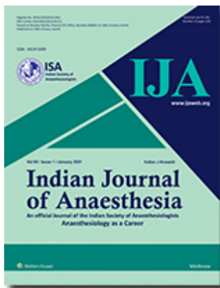
Table of Contents - Current issue