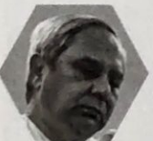
50 NAVEEN PATNAIK Chief Minister, ODISHA