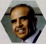
78 SUNIL BHARTI MITTAL Chairman, BHARTI ENTERPRISES