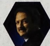
94 AJAY PIRAMAL Chairman, PIRAMAL GROUP