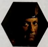
76 GENERAL BIPIN RAWAT Chief of Defence Staff