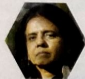
188 SUNITA NARAIN Environmentalist & Director General, CENTRE FOR SCIENCE AND ENVIRONMENT