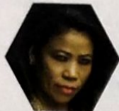
186 MARY KOM Boxer