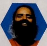
84 SWAMI RAMDEV Yoga guru