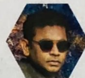
90 A.R. RAHMAN Music composer