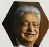
56 AZIM PREMJI Founder-chairman, WIPRO