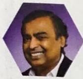
26 MUKESH AMBANI Chairman & MD, RELIANCE INDUSTRIES