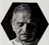
40 GULZAR Poet, Filmmaker