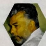
206 PERUMAL MURUGAN Author