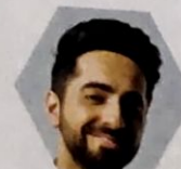
114 AYUSHMANN KHURRANA Actor