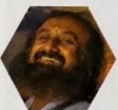
44 SRI SRI RAVI SHANKAR Spiritual leader