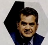
110 AMITABH KANT CEO, NITI AAYOG