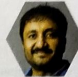
212 ANAND KUMAR Founder, SUPER 30