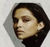
98 DEEPIKA PADUKONE Actor