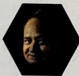
69 ASHOK GEHLOT Chief Minister, RAJASTHAN