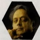
197 SHASHI THAROOR Politician, Author