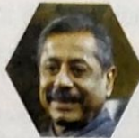
194 DR NARESH TREHAN Chairman & MD, MEDANTA