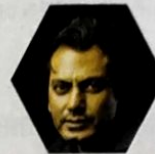
216 NAWAZUDDIN SIDDIQUI Actor