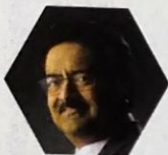
32 KUMAR MANGALAM BIRLA Chairman, ADITYA BIRLA GROUP