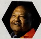
66 ANIL AGARWAL Executive Chairman, VEDANTA RESOURCES