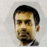
202 PULLELA GOPICHAND Badminton coach