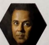
53 CHETAN BHAGAT Author