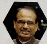
101 SHIVRAJ SINGH CHOUHAN Chief Minister, MADHYA PRADESH