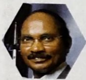
36 DR K. SIVAN Chairman, INDIAN SPACE RESEARCH ORGANISATION