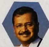
62 ARVIND KEJRIWAL Chief Minister, DELHI