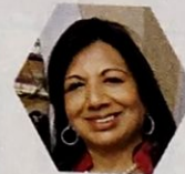
107 KIRAN MAZUMDAR-SHAW Chairperson & MD, BIOCON