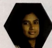
190 MITHALI RAJ Cricketer