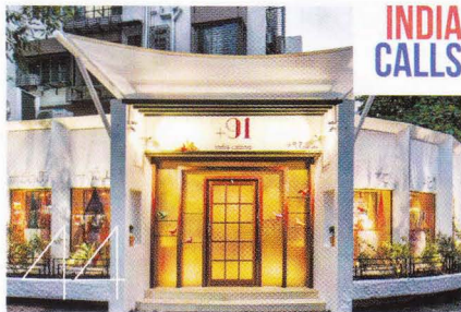
Minnie Bhatt designs +91, an Indian restaurant with no adherence to any particular trend in interiors