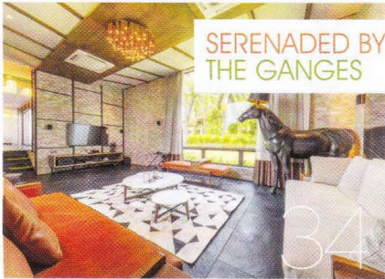
Spaces and Design provide a timeless and nurturing ambience to BMA villa located in Raichak