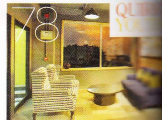
The Delhi office of the Nando's has been designed by group DIGNO. The work culture of the multinational showcase South African art collection