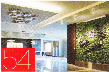
SMART LIVING Home Review brings you a wider perspective on the approaching interconnectivity of design and technology in life