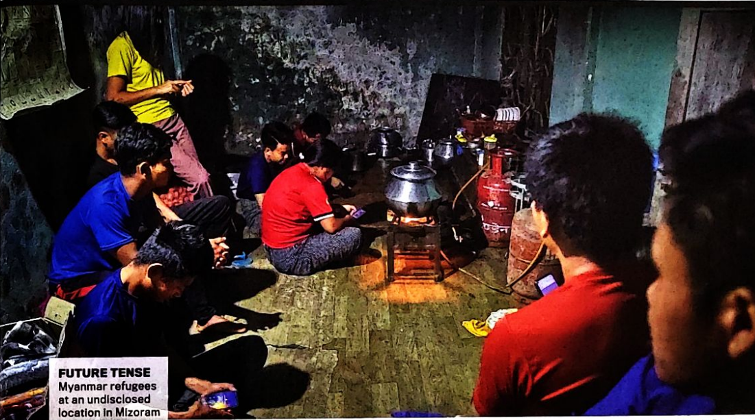
FUTURE TENSE Myanmar refugees at an undisclosed location in Mizoram