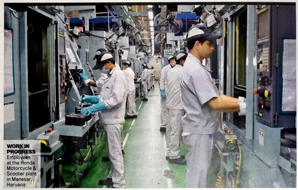
WORK IN PROGRESS Employees at the Honda Motorcycle & Scooter plant in Manesar, Haryana