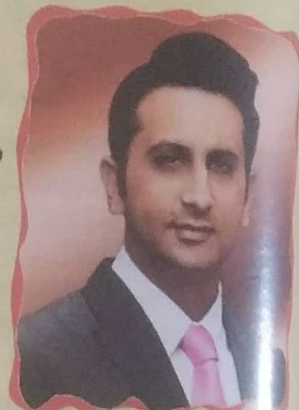
Personality Plus : p. 62