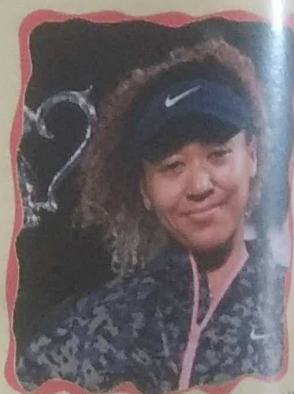
Australian Open 2021 : p. 160