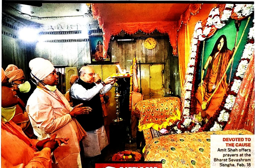
DEVOTED TO THE CAUSE Amit Shah offers prayers at the Bharat Sevashram Sangha, Feb. 18

TELANGANA: KCR'S CASTE HEADACHE PG 14 PUDUCHERRY: DECODING A COUP PG 18