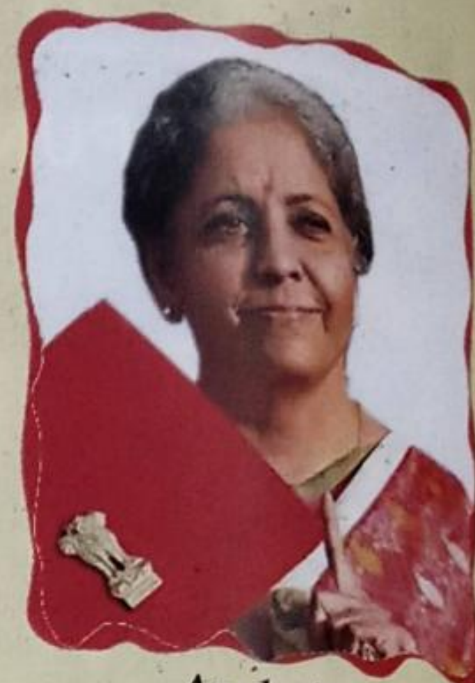
Analysis Of Current Issues : p. 11