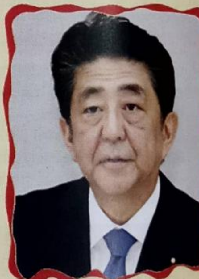
Padma Awards 2021 : p. 10