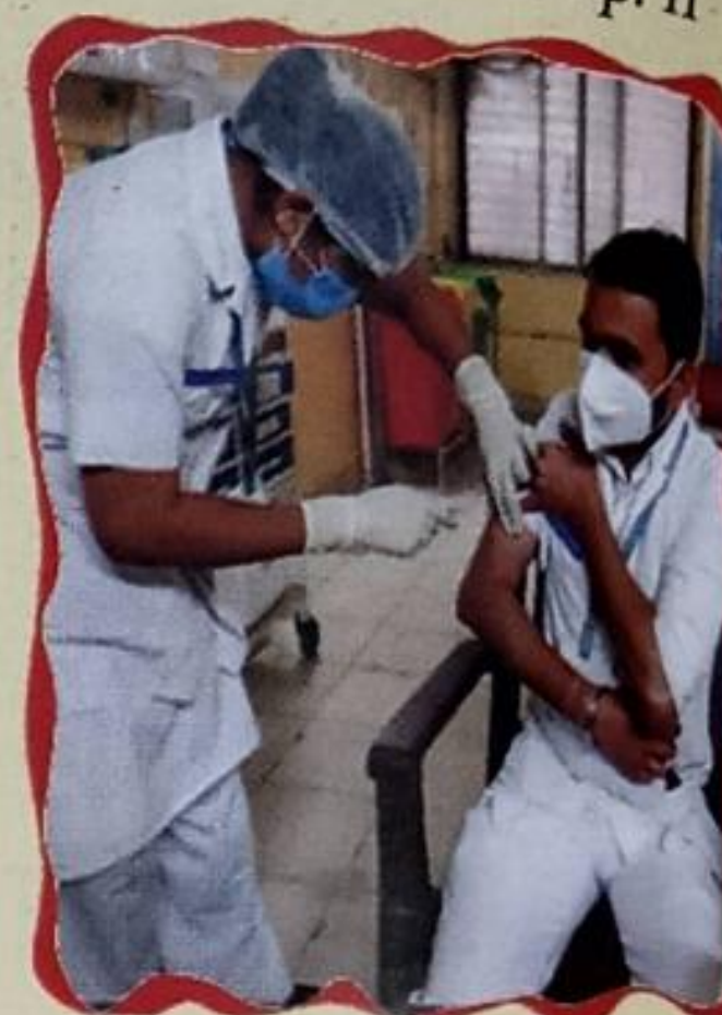
India : p. 21